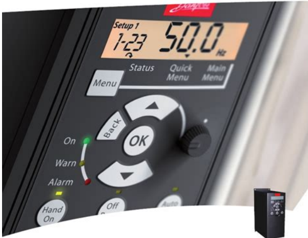
Guia de Programação VLT® Micro Drive